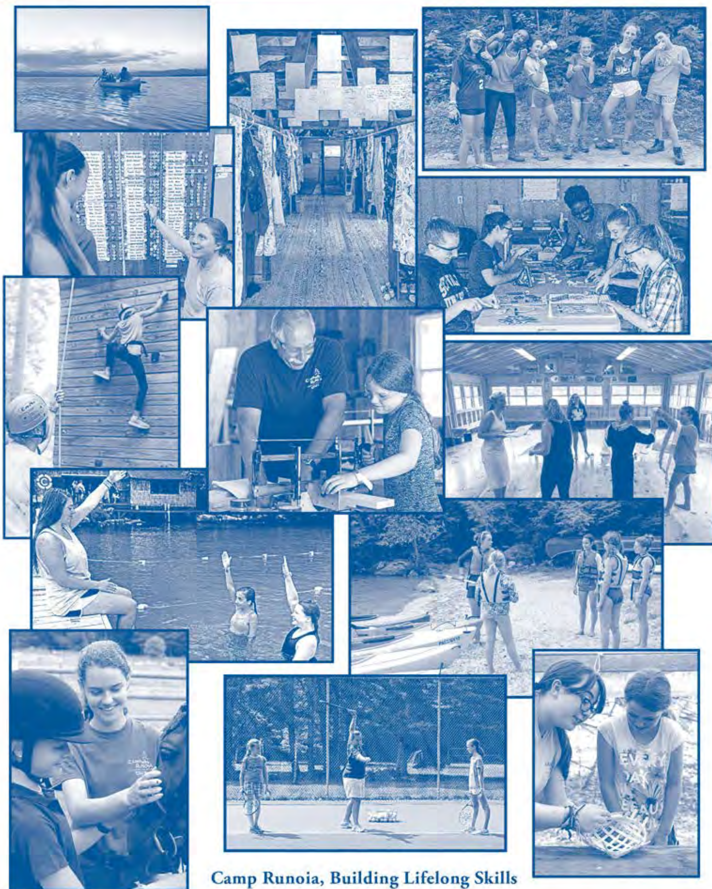
Camp Runoia, Building Lifelong Skills